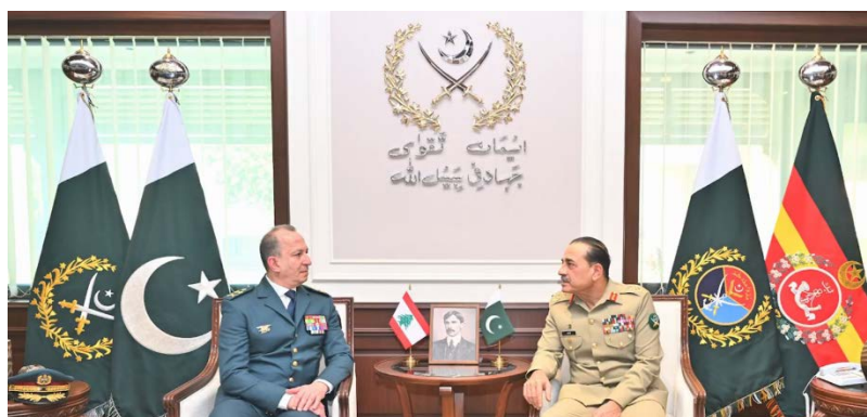
Haykal meets with the commander of the Pakistan army (Lebanese army X account, June 10, 2026)

► Lebanese army Commander Rudolf Haykal visited Pakistan as part of the Lebanese army's efforts to expand its security and military ties beyond the circle of traditional partners in the West and Arab countries. He and his hosts discussed possibilities for increasing cooperation in training, force buildup and support for the Lebanese army in view of the security challenges it faces, along with exposure to Pakistan's security and industrial capabilities (Lebanese army X account, June 10, 2026).