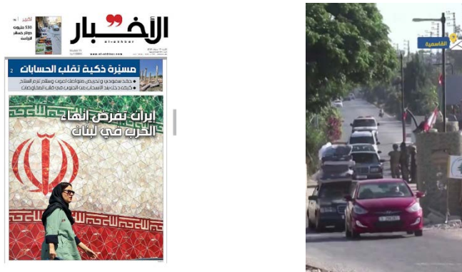
Right: Lebanese return to the town of al-Qassamiya (al-Manar, June 15, 2026). Left: Front page of Hezbollah's al-Akhbar . "Iran imposed the end of the war in Lebanon" ( al-Akhbar , June 15, 2026)