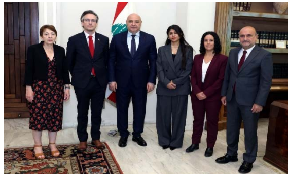
Aoun meets with European parliamentarians (Lebanese presidency X account, June 9, 2026)

► Meeting with European parliamentarians, Aoun called for increased assistance to the army and state institutions and said strengthening Lebanese sovereignty was a key condition for national stability. He said the lessons and high price of the recent war showed that a political course had to be prioritized over military confrontation, along with the deployment of the Lebanese army in the south, an Israeli withdrawal and the gradual "resolution of the issue of Hezbollah's weapons." He reiterated the importance of national unity, strengthening state security mechanisms and rejecting a situation of a "state within a state" (Lebanese presidency X account, June 9-10, 2026).