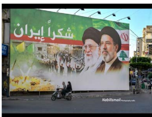
Billboard in Beirut reading "Thank You Iran"