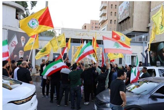
Supporters of Kata'ib Sayyid al-Shuhadaa celebrate in Baghdad