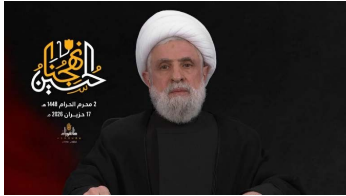
Qassem delivers his speech (al-Ahed, June 17, 2026)