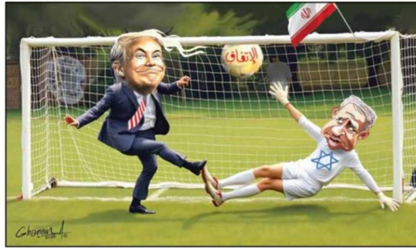
Netanyahu fails to stop the MOU (al-Joumhouria, June 18, 2026)

► Senior Hezbollah-affiliated Shi'ite religious figures also thanked Iran for its efforts to stop the war in Lebanon, while demanding that the Lebanese government cease negotiations with Israel: