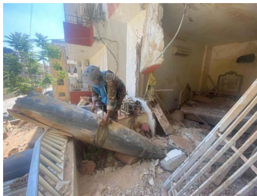
A Lebanese army bomb-disposal expert neutralizes an unexploded bomb (Lebanese army X account, June 16, 2026)