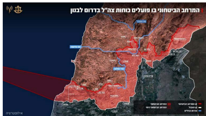
Right: The area of IDF operations in south Lebanon (IDF spokesperson, June 18, 2026). Left: UAVs found in the underground facility in Majdal Zoun (IDF spokesperson, June 21, 2026)